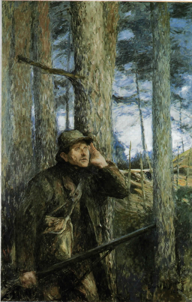
Poacher , 1894. Bruno Liljefors. Oil on canvas, 61 x 41 cm. Statens Konstmuseer, Stockholm.

IN A FOREST of mixed growth somewhere on the eastern spurs of the Carpathians, 1 a man stood one winter night watching and listening, as though he waited for some beast of the woods to come within the range of his vision, and, later, of his rifle. But the game for whose presence he kept so keen an outlook was none that figured in the sportsman's calendar as lawful and proper for the chase; Ulrich von Gradwitz 2 patrolled the dark forest in quest of a human enemy.