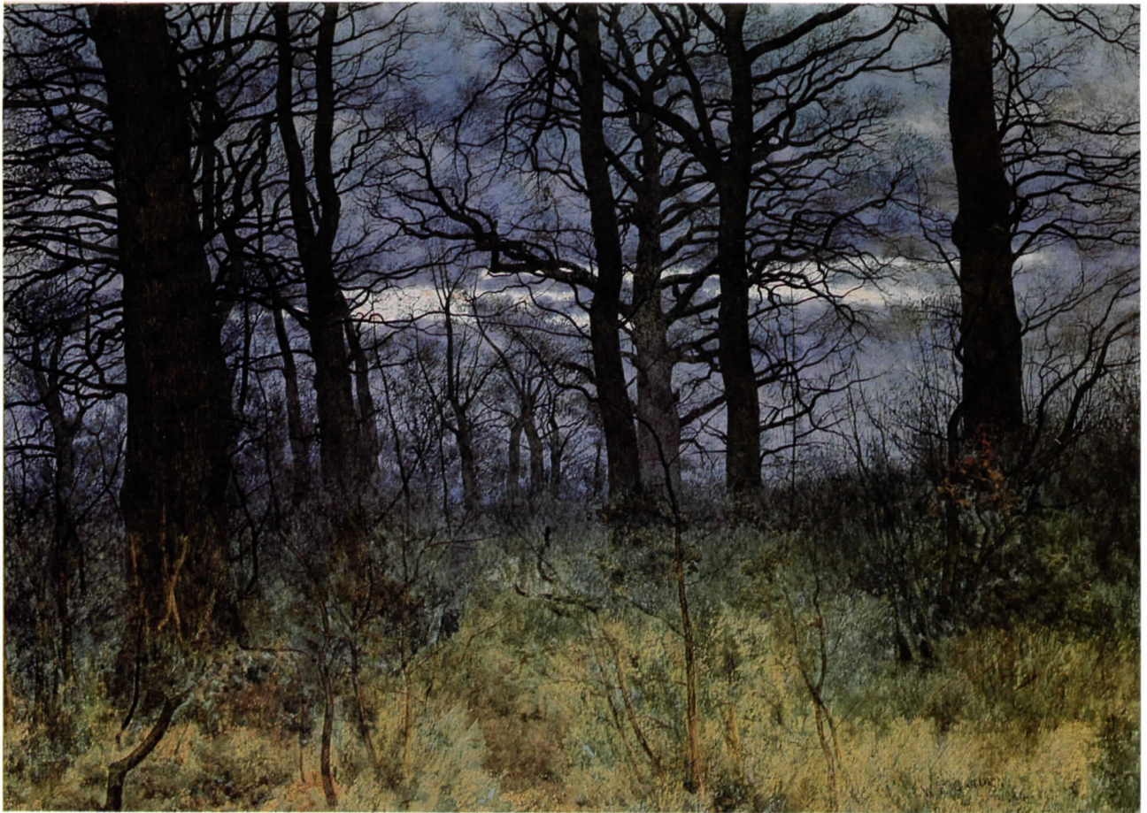
The Wood at Dusk . William Fraser Garden (1856–1921). Watercolor. Private collection.

Viewing the painting: How does this scene help you picture the setting of the story?